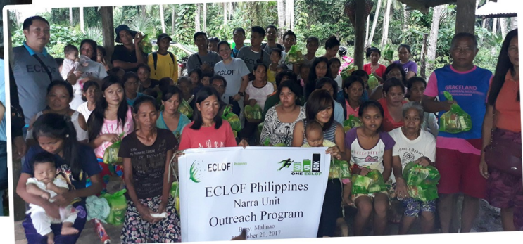
North Palawan Branch staff gave groceries to selected indigenous and urban poor communities.