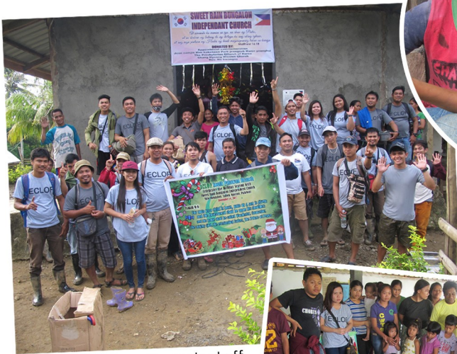
South Palawan Branch staff conducted a gift giving with a church community.