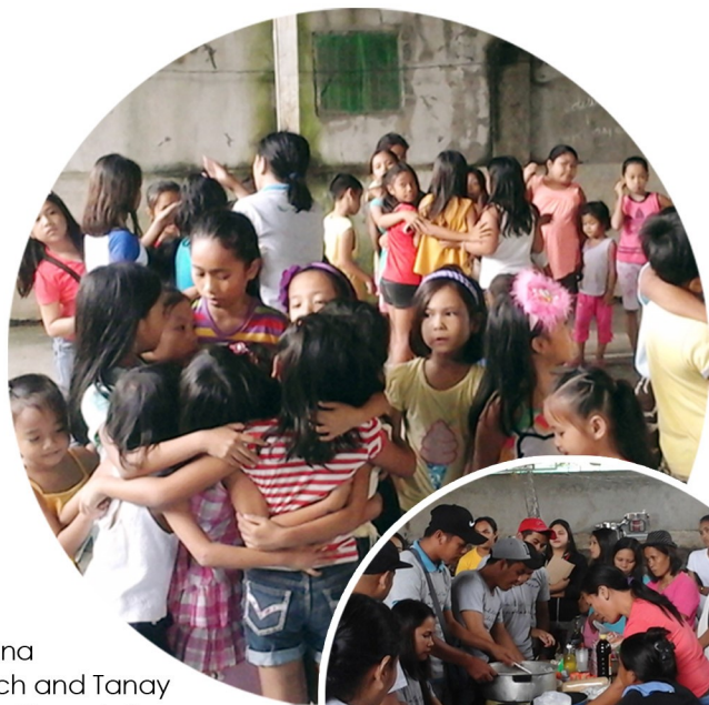
Laguna Branch and Tanay Unit Offices staff taught mothers on how to make longanisa; while keeping their kids at play.

To share the spirit and message of giving of Christmas, ECLOF conducted different outreach activities in selected communities where we are operating. The outreach activities were done by branch staff and benefited families & communities that include indigenous communities, church, school and urban poor families.