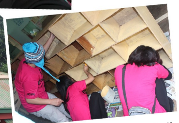
Baguio-Atok Branch staff visited a day care center and helped in painting and landscaping of the school.