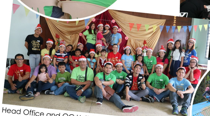
Head Office and QC Unit Office staff with their families went to children's home and became their ninongs and ninangs for a day.