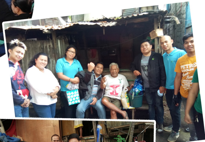
Cainta and Marikina Branches staff gave grocery items to selected poor families in their area.