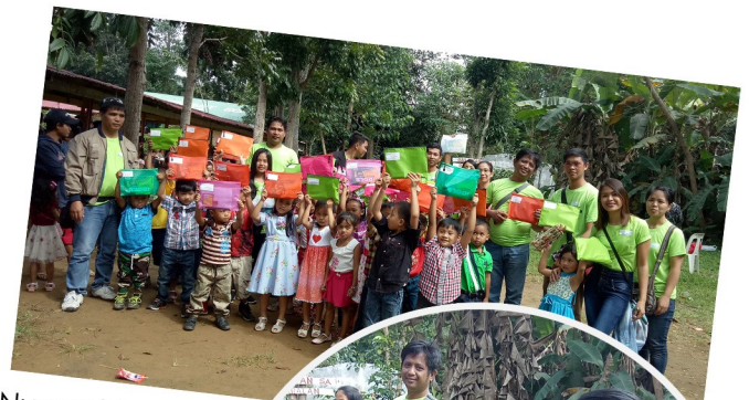
Nueva Vizcaya Branch staff brought joy to day care pupils.

ECLOF staff on the other hand were thankful and blessed of the opportunity. Indeed, it was both a humbling and joyful experience. It was humbling because while each one has his/her own challenges to bear, we realized we can still be a blessing if we focus on others. It was joyful because we were able to share our blessings of gifts and services to the people we have visited. Importantly, we were able to share God's Word to them. Indeed, we are all blessed!