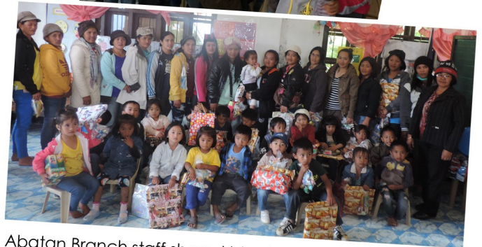
Abatan Branch staff shared blessings to day care pupils.